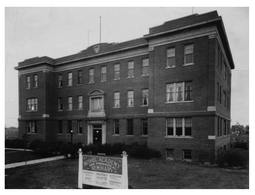
Bethel Academy and Theological Seminary, St. Paul, MN, in 1920.

Throughout the years, Bethel has remembered its rich heritage and held to the guiding principles of its founder while forging a Christ-led vision for the future.