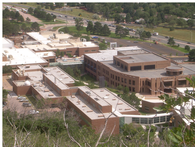
The University of Colorado at Colorado Springs