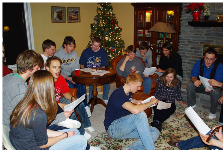
Traditional physics chants resonate with students as they echo throughout the halls of the Steins' home