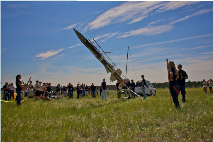
“Future” being raised onto the launch pad